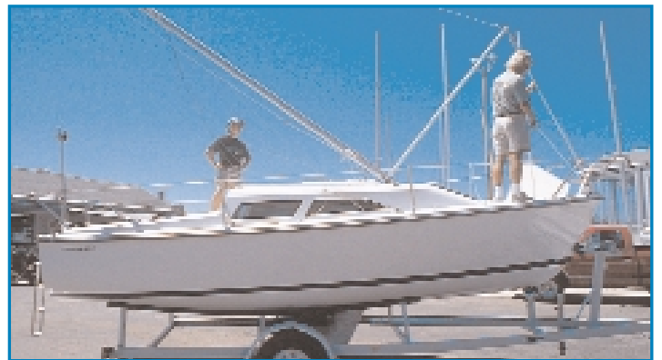
The mast raising system makes pre-launch preparation fast and easy.

With all these changes, one aspect has remained the same. To compete in the huge one design association, all underwater surfaces, rigging and sailplan have not been changed in order to maintain eligibility with thousands of other Catalina 22 sailors in established one design fleets.