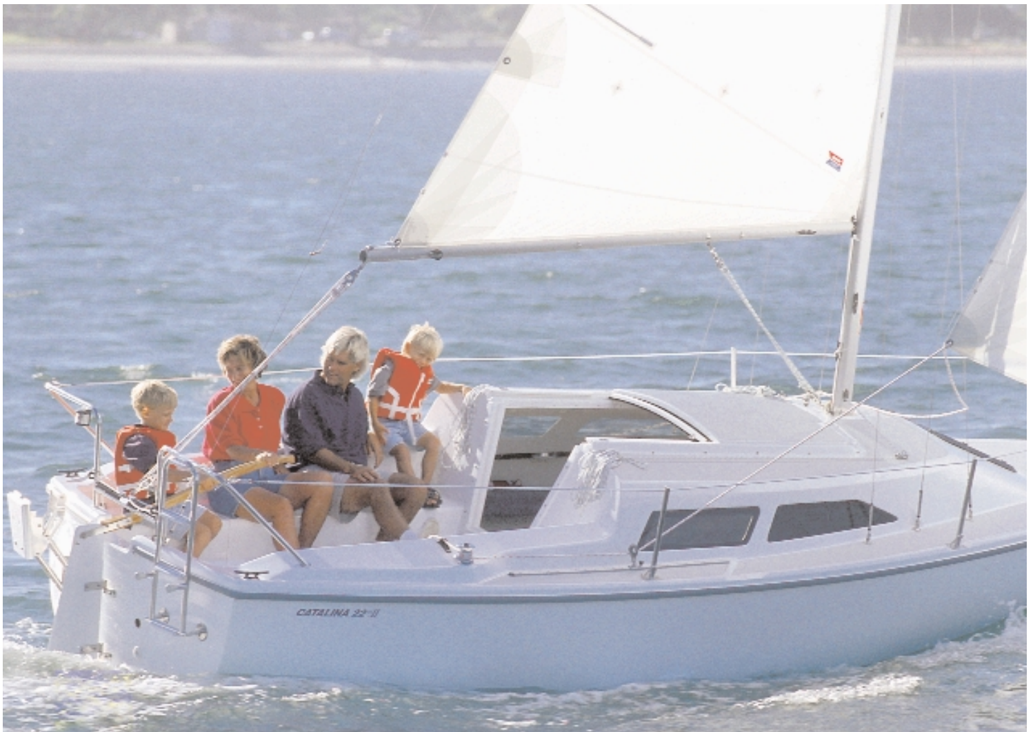
Fast, safe, and handsome. The Catalina 22markII continues to meet the needs of today's sailing family. Over 15,000 owners have made the Catalina 22 the most popular family small cruiser in history.