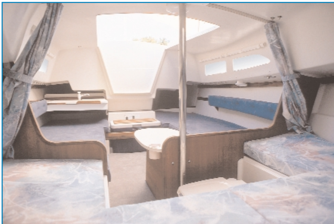
A 48 quart removable cooler and available galley provide all the necessities for enjoyable meals aboard. The forepeak can be curtained off for privacy in the head or with center cushion in place, as forward berth.