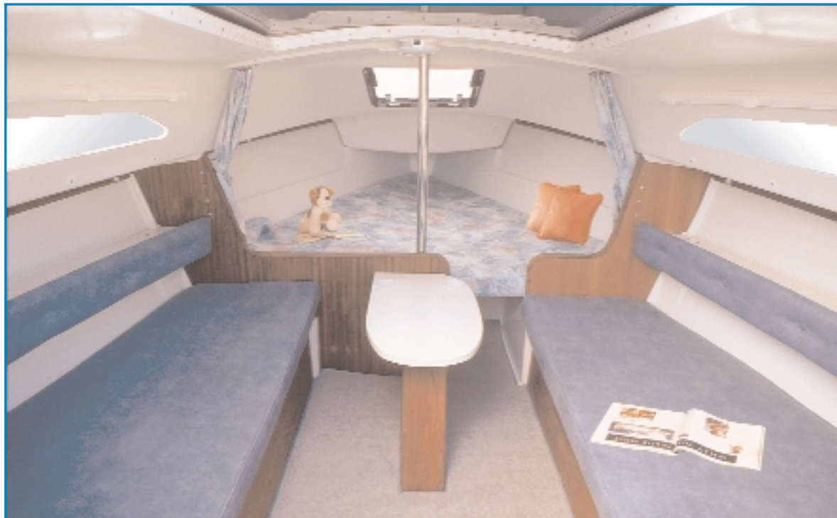
A great place for the family to spend the weekend. There are large, lined storage bins under the seats, port and starboard. The standard plexiglass overhead hatch lifts to make the largest "pop-top" ever.